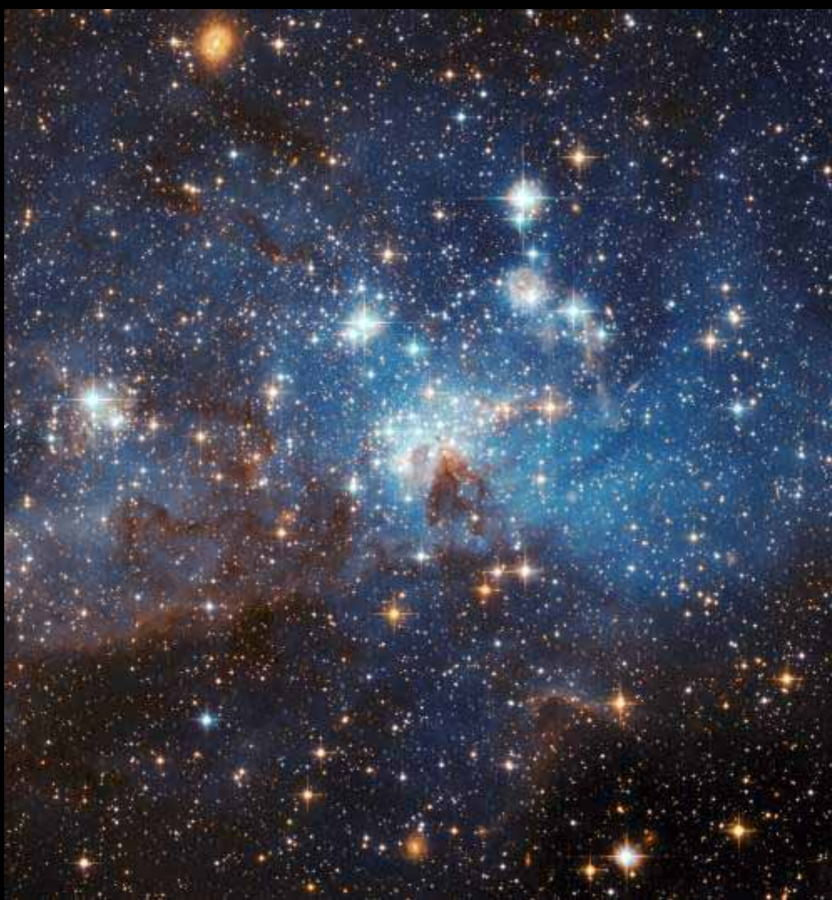
Star-Forming Region LH 95 in the Large Magellanic Cloud