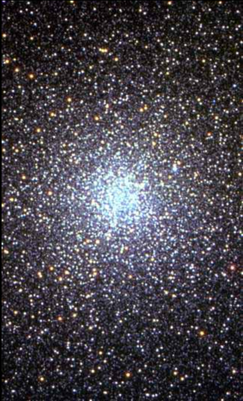
Globular Cluster 47 Tucanae